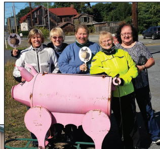
BBQ? Ice cream? We're there.