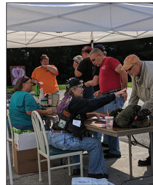
Riders register at our annual charity ride to benefit H.O.P.E.