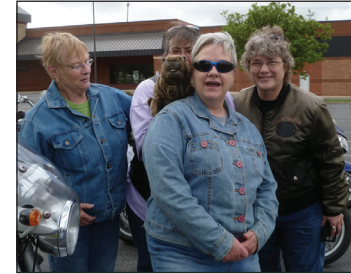
Mascot Gertie the Groundhog says, "Come ride with us!"