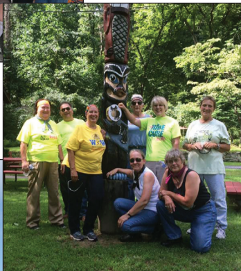
Stopping to crow about International Female Ride Day!