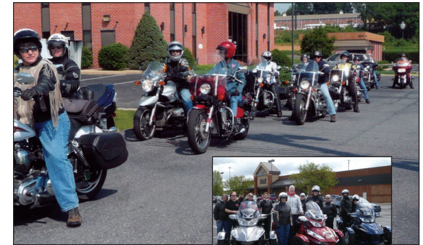
Heading out for a "Second Sunday Ride" on 2 or 3 wheels. (Support Guys are always welcome, too.)