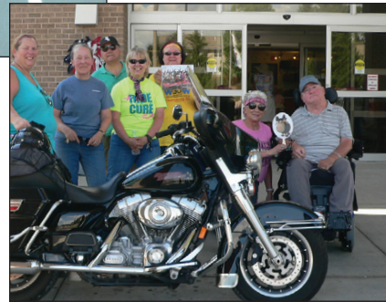
Supporting other bike clubs' charity rides, too.