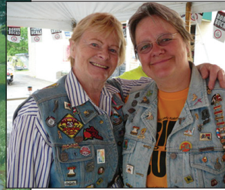
Mother and daughter, both riding with the chapter!